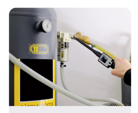
Scan with the focus tube and focus tip the roughly location till the exact location is found.

S530 Ultrasonic Leak Detector www.kompauto.com