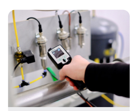
Detection at medium distance for locating the leakage area.