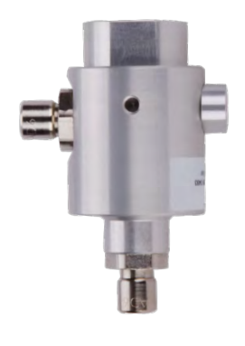
By-pass measuring chamber with 6 mm hose connections as in- and outlet