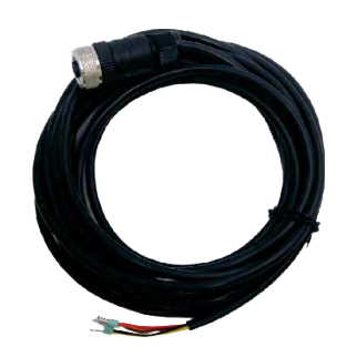
M12 Sensor cable with open ends 5 m or 10 m