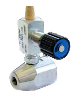
High pressure measuring chamber for applications up to 35.0 MPa