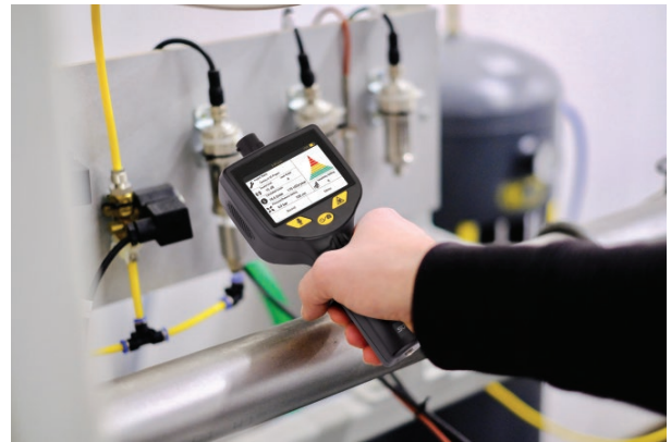
Ultrasonic Leak Detector S531