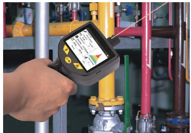
Leak detection from distance with the integrated laser pointer