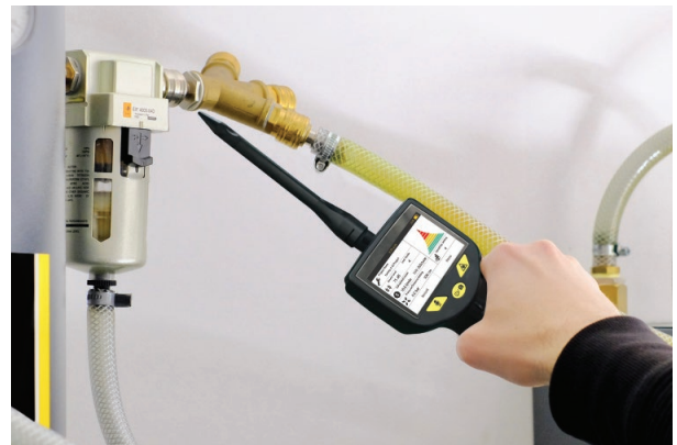
Leak detection with focus tube