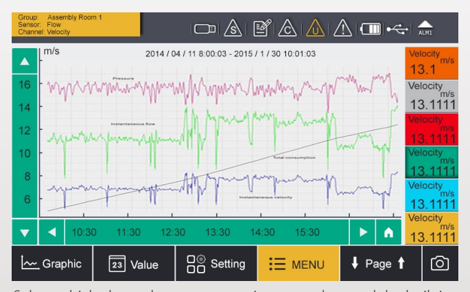
Select which channels you want to view or analyze and the built in graphic analyzer will help you identify problems immediately.

For detailed analysis we recommend using SUTO S4M software.