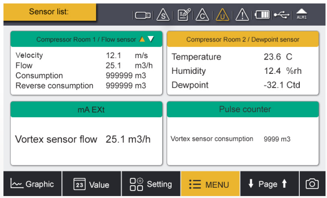
Up to 4 sensors can be viewed on one page and through page scrolling further sensors can be displayed.