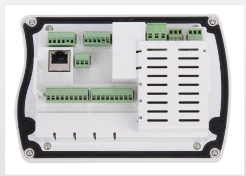
Back view with connection terminals