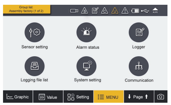
The S330 / S331 comes with a high resolution 5" colour touch screen interface making the operation as simple as possible.