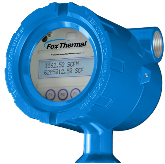
The Model FT4A flowmeter and temperature transmitter is approved for FM/FMc Class I, Division 1, ATEX/IECEX Zone 1. CE Mark. Accuracy compliant with BLM 3175 & API 14.10.

The Reference RTD measures the gas temperature. The instrument electronics heat the mass flow sensor, or heated element, to a constant temperature differential (constant \Delta T ) above the gas temperature and measures the cooling effect of the gas flow. The electrical power required to maintain a constant temperature differential is directly proportional to the gas mass flow rate. The microprocessor linearizes this signal to deliver a linear 4-20mA signal.